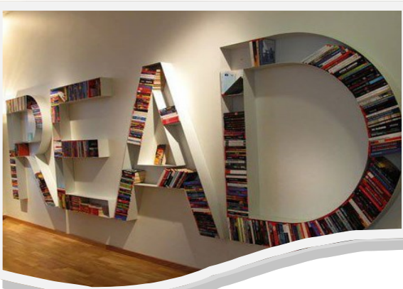
The Riyadh International Book Fair was held March 6-15, 2012 at the Riyadh International