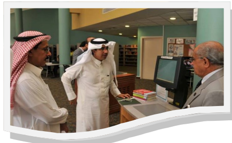
Delegates from the Ministry of Higher Education visit PMU on May 12, 2012