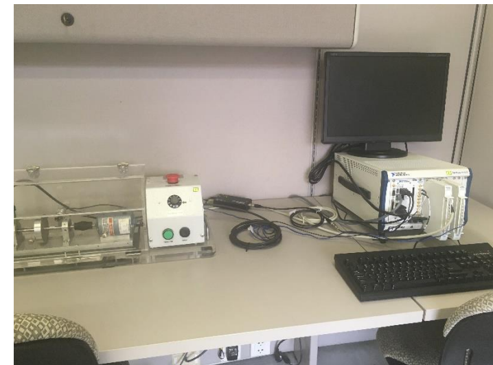
Machine Health Monitoring Setup