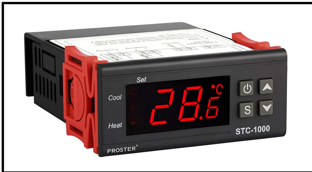
Figure # 5: Digital Weight Scale