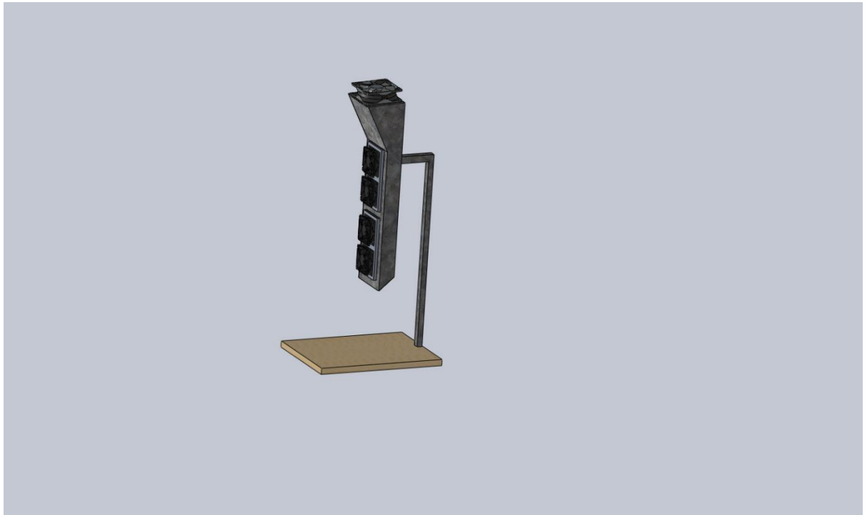
Figure # 2: Air Water Generator CAD Model