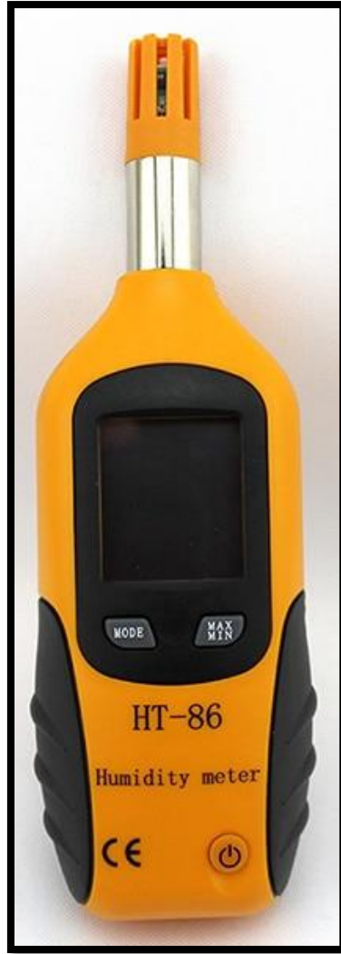
Figure # 4: Humidity Meter